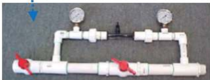
Venturi air injector with by-pass

Off-take from raw water tank slightly elevated to avoid drawing in sludge float switches in raw water tank control start/stop of bore pump Note; Backwash at 103 lpm at 3 bar pressure