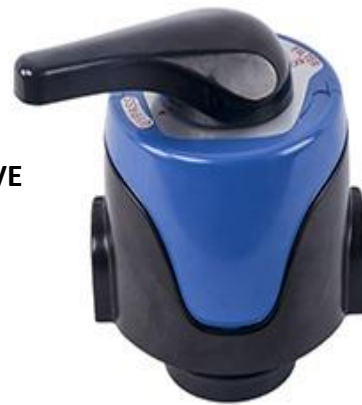
MANUAL MULTI-PORT VALVE F56K (51204K)

INDUSTRIAL FRP PRESSURE VESSEL TANK 18"x65" 100% corrosion resistant and made from high-performance composite material food grade HDPE seamless liner with FRP filament winding.